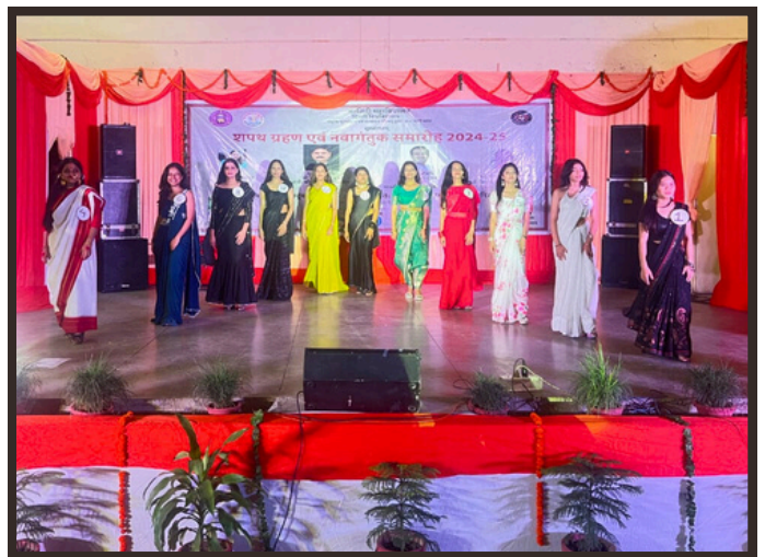
Participant's of Miss Freshers Competition 2024-25