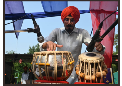
Taalmixer performing at Mahima 2024