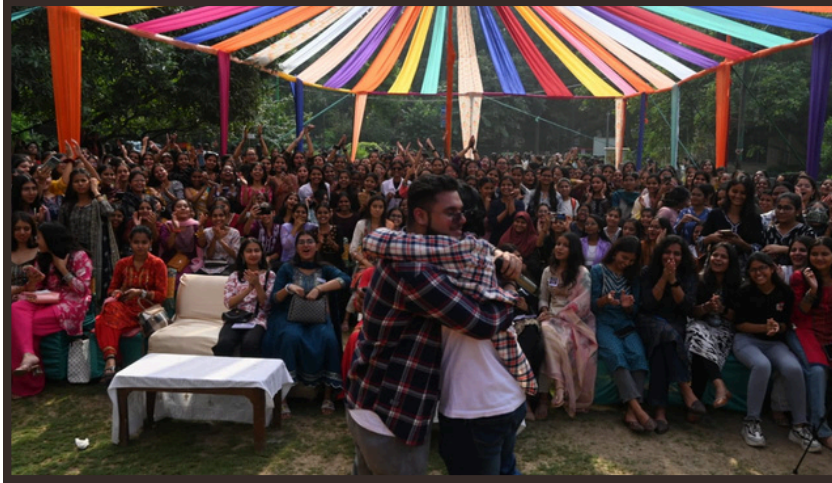
The Lovers Duo