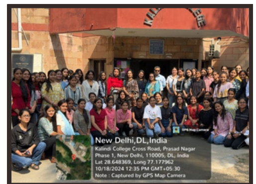
Faculty Members and Students after successful completion of the workshop

clarity, and the avoidance of jargon to make writing more accessible to the audience. She guided the participants on how these principles can be effectively used in journalistic writing to convey information with precision while keeping the reader engaged. .