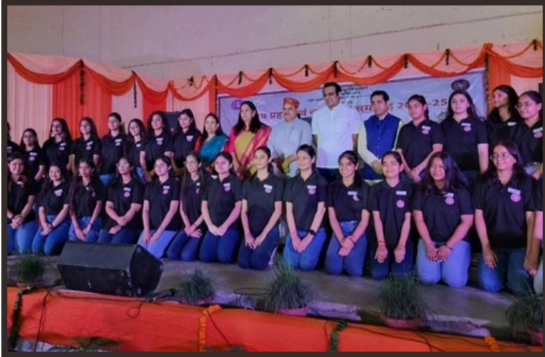
Students' Union 2024-25