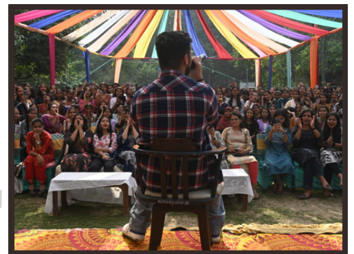
Audience enjoying The Lovers Performance