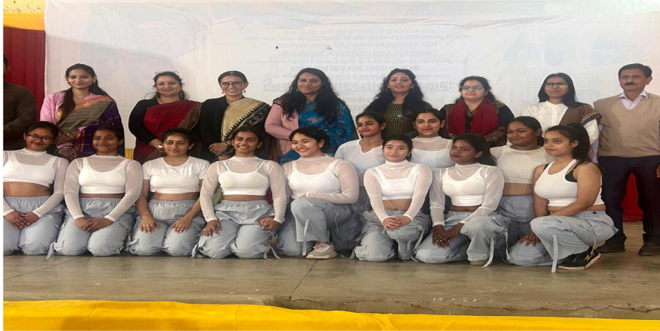
Karma- Western Dance team