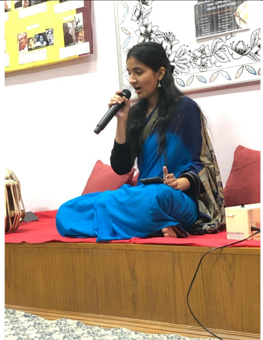
Symphony Music Club : Solo Singing competition