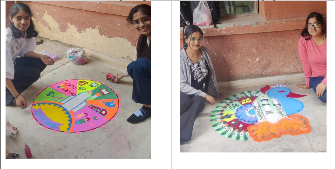
Participants in rangoli making competition