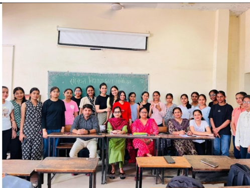
Prshnottari Pratiyogita was held on 9 April 2025