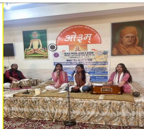
An outreach program Students are Performing in Arya Mahila Ashram