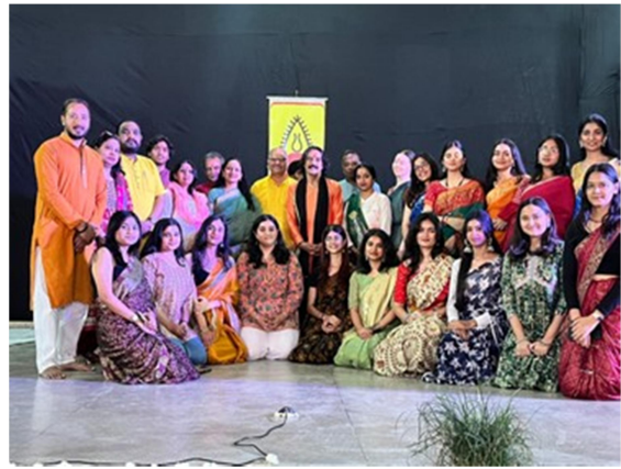
Kalindi student volunteers in SPIC MACAY