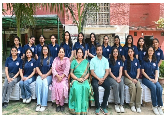
National Service Scheme (NSS)