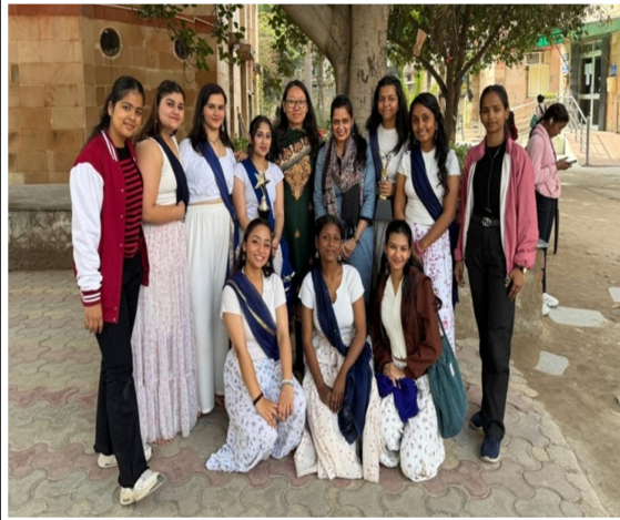
Nupur Indian Group Dance Club: Thematic Dance Showcase