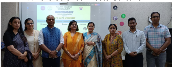
Two-day workshop by Biocenosys on “Science, Technology, and Wellness: Transforming Lives through Innovation.”