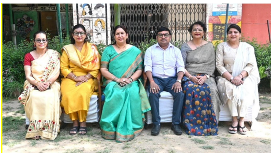
Internal Quality Assurance Cell (IQAC)