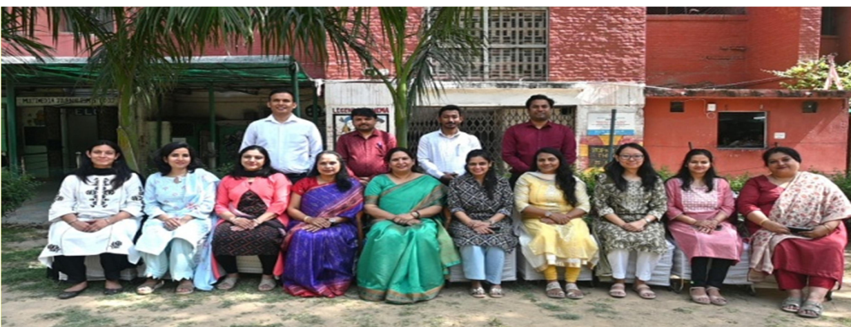
Annual Report Committee