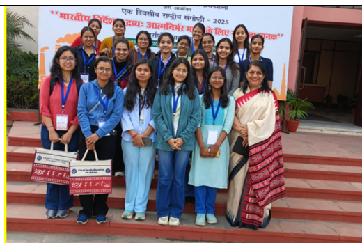
Students visited the National Physical Laboratory (NPL) for the "भारतीयनिर्देशकद्रव्य: आत्मनिर्भरभारतकेलिएगुणवत्तामानक" translates to "Indian Reference Material: Quality Standards for a Self-Reliant India."