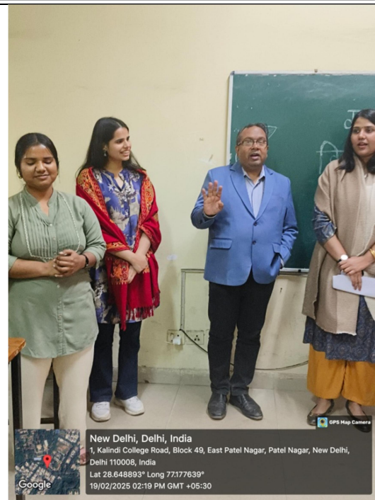
Kavya Srishti club: Intra-College Competition