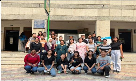
Cell members after the orientation with faculty