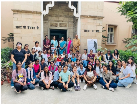
Visit to Gandhi museum by students