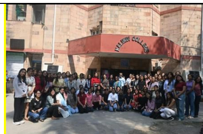
Workshop on “Precision and Principles: Effective language in Journalism”