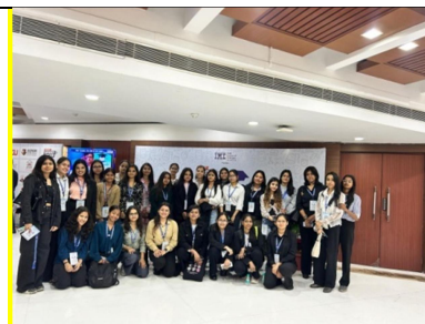
Students participates in the India TV Educational Conclave