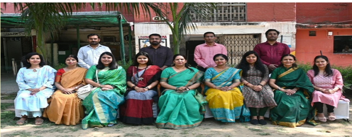
Academic Journal Committee