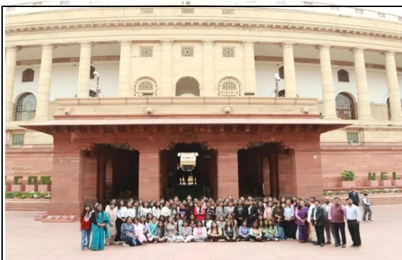
Educational excursion to the Parliament of India