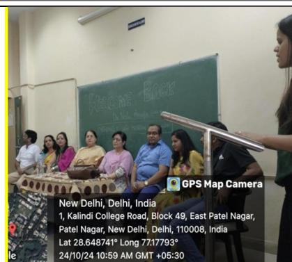
Lecture and Oath Ceremony