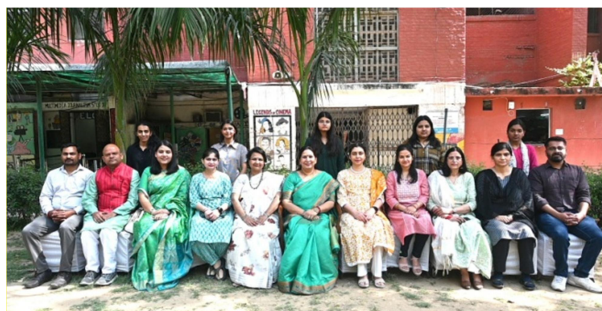
Pravah: College Magazine Committee