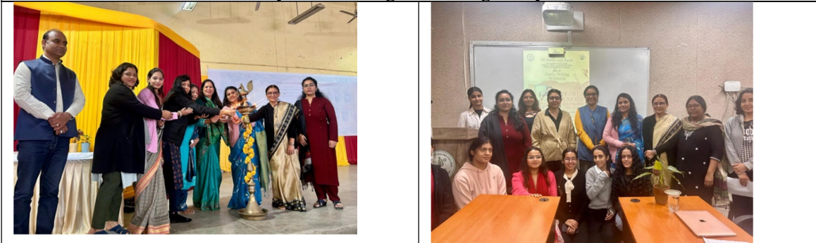
Inaugural of ECA Programs on 19/2/25