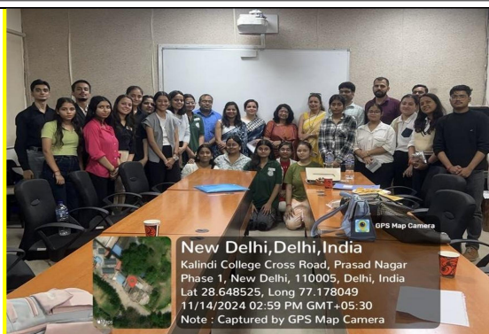
Paper presentation competition