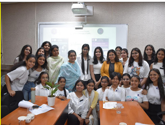
Team photograph after the badge ceremony of Team Sattva 2024-25