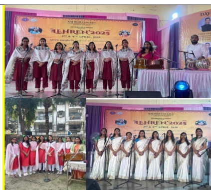
Music Department Performing in College Events