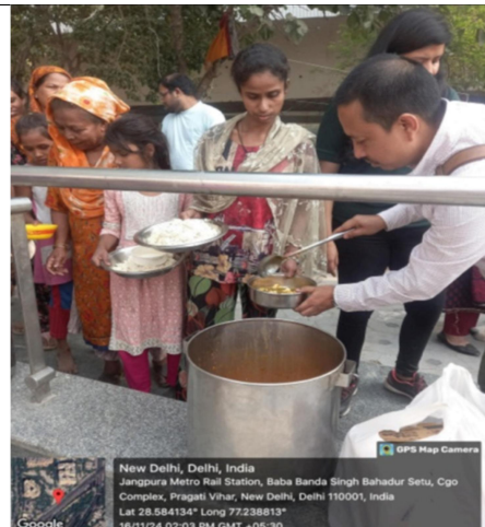
Nourish & Flourish: Outreach Programme on Nutrition & Hygiene