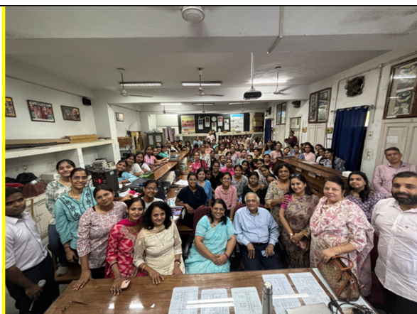
National workshop on Quantum Mechanics