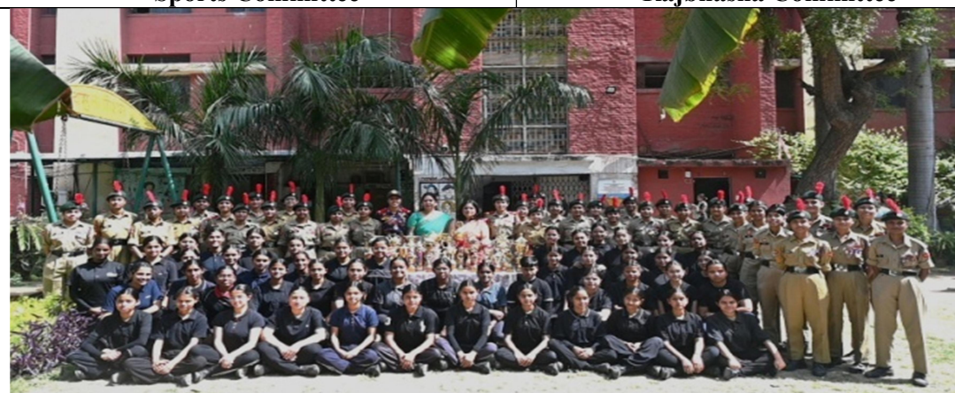
National Cadet Corps(NCC)