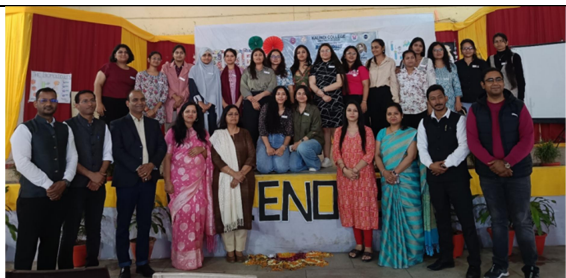
Academic fest of Biocenosys “Time Warp – Where Science Meets Culture”