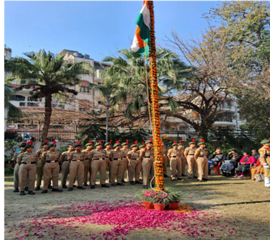
NCC Cadets in Republic Day Celebration