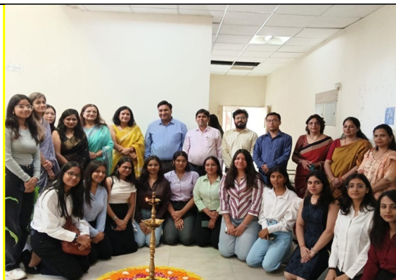
Inauguration of seminar “Decoding Economic Research: Tools, Techniques and Methodologies”