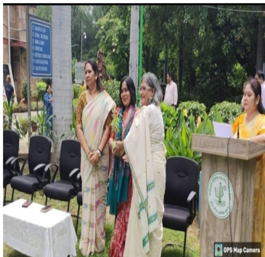
78 th Independence Day, 2024