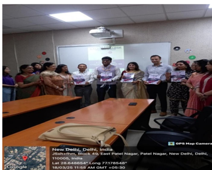
Anahi - The Annual Botanical Fest