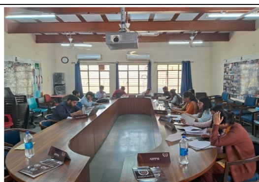
March 7&8 , 2025, The Model United Nations