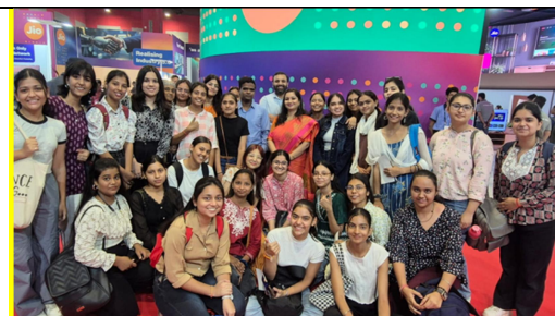
Visit to Indian Mobile Congress at Bharat Mandapam, 18 October 2024