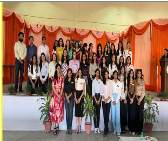
Inaugural ceremony of KaCES: Department of Economics