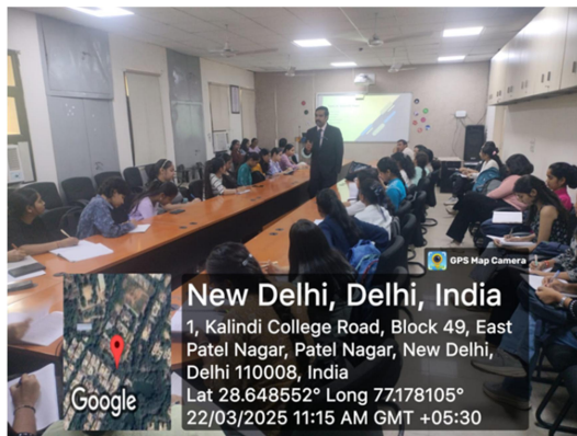
Lecture during the 2-days skill enhancement workshop on Research Methodology