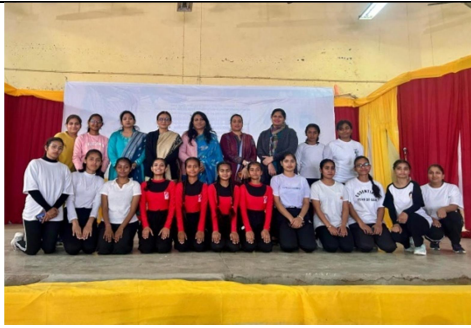
Yoga and Aerobics with ECA Team