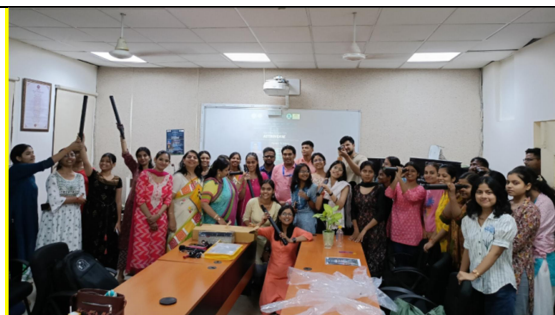
National Space Day event sponsored by the National Academy of Sciences, India (NASI)