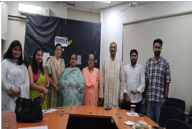
Sanskrit Speaking Workshop in the collaboration with Sanskrit Bharti