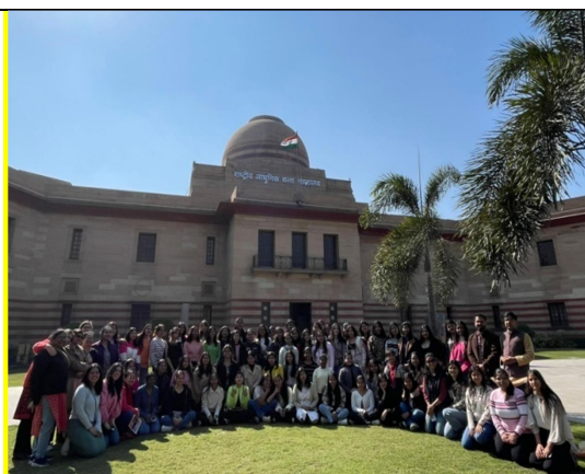
A field trip to the National Gallery of Modern Art (NGMA)