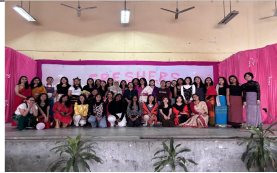
Cell members & faculty after Oath Ceremony