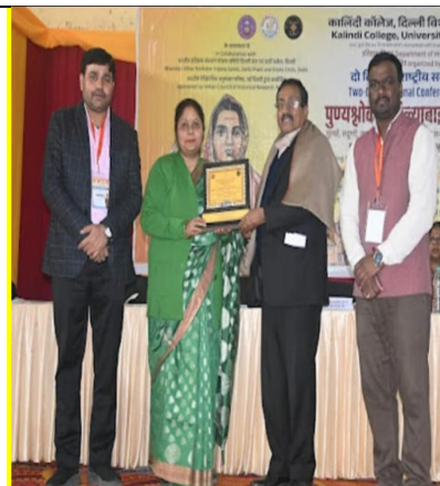
National Conference on Punyashloka Ahilya Bai Holker