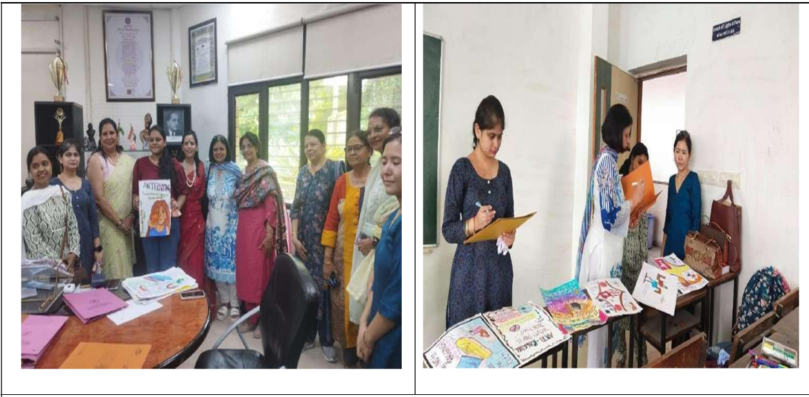
Paint &Brush: A Poster Making Competition on the theme 'Anti-Ragging'