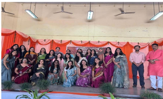
Orientation and Fresher's welcome