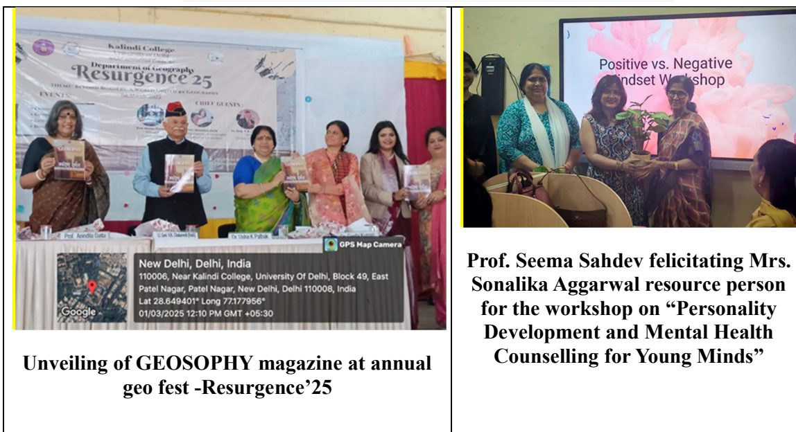
Unveiling of GEOSOPHY magazine at annual geo fest -Resurgence'25