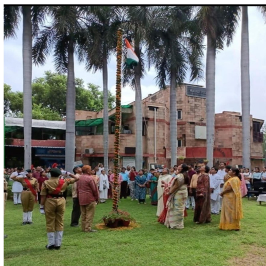
Flag Hoisting 78 th Independence Day, 2024