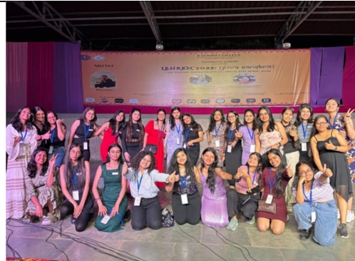
Students' Union with Hon'ble Cabinet Minister Shri Chirag Paswan, in Annual Cultural Fest LEHREN' 25