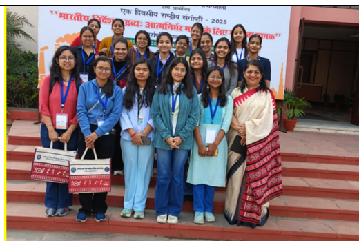
Students visited the National Physical Laboratory (NPL) for the "भारतीयनिर्देशकद्रव्यः आत्मनिर्भरभारतकेलिएगुणवत्तामानक" translates to "Indian Reference Material: Quality Standards for a Self-Reliant India."