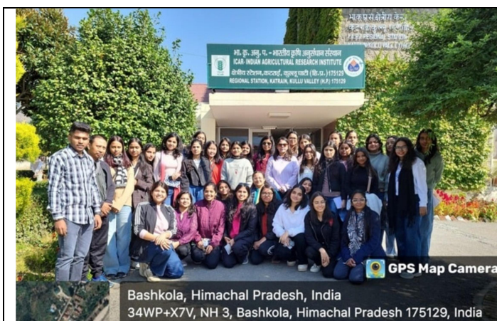
Educational Trip: Visit to Kullu Manali