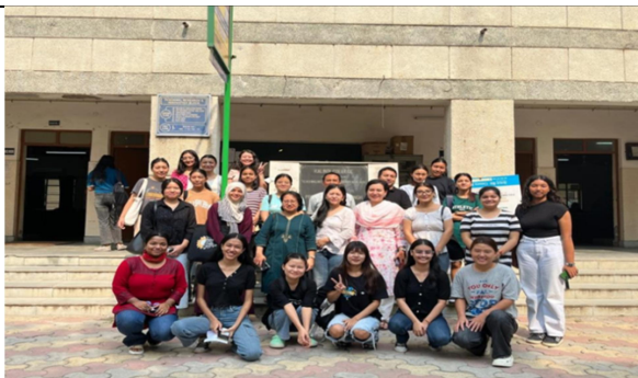
Cell members after the orientation with faculty