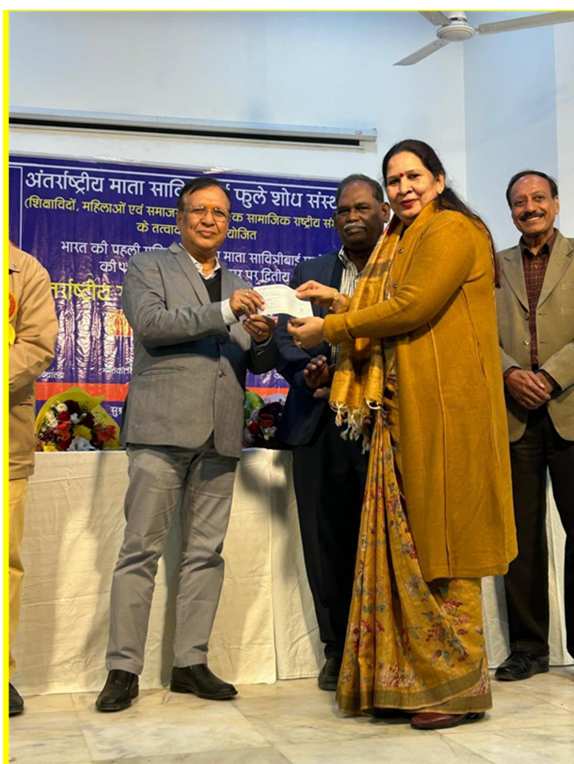
Savitri Bai Phule International Award