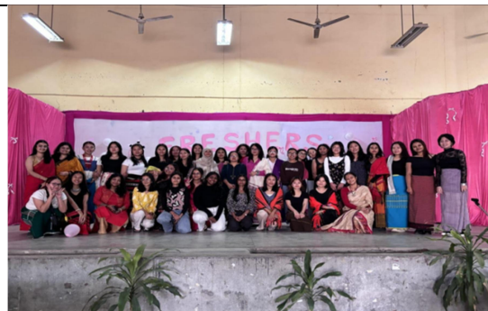
Cell members & faculty after Oath Ceremony