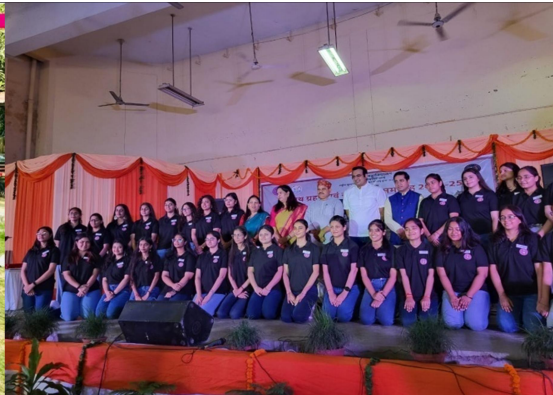
Oath Ceremony of the Union