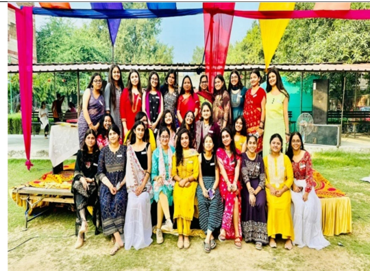
Mahima: Diwali Festival 23 October, 2024