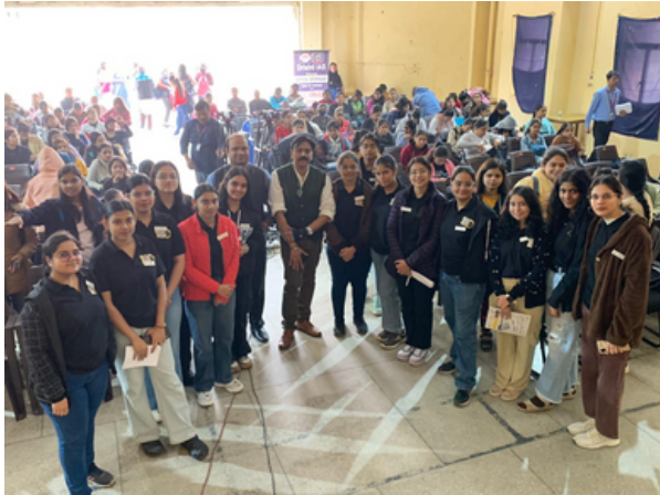
Dristi IAS Coaching carrier counselling seminar