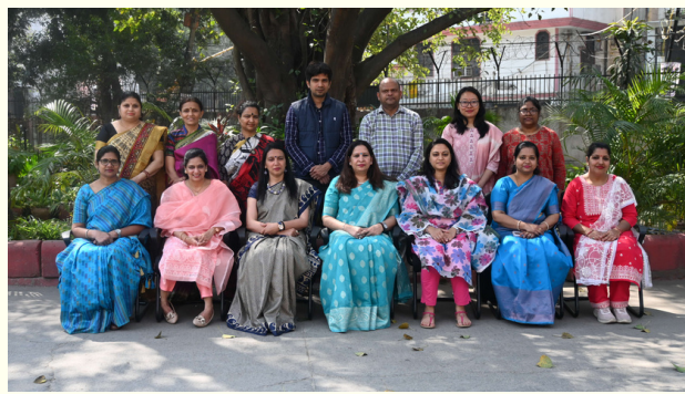
Academic Journal Committee