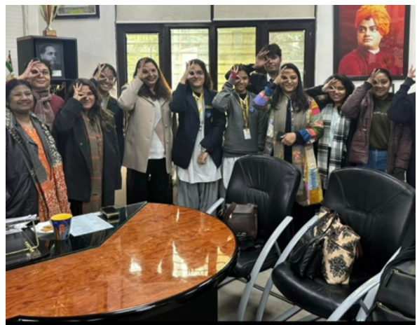
Social Initiative of Eye safety awareness campaign workshop on Safe Eye Make-Up organised by the English Literary Society in collaboration with Drigshresththa, Youth Power team, Amity International School, Noida on 19th January 2024