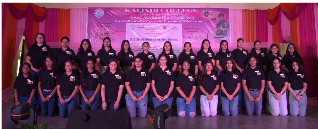
Student Union 2023- 24