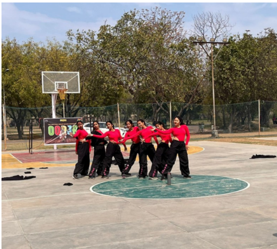
Team karma performing at NSUT