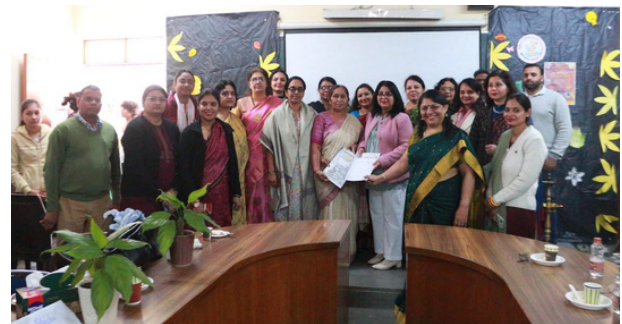
Physics Department along with Guest Speakers at National Science Day Celebration on 28.2.24