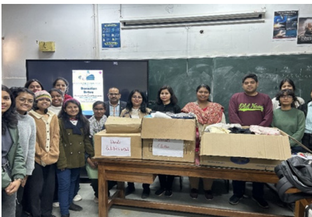
Community Outreach Program: Donation Drive 5-8 Feb 2023