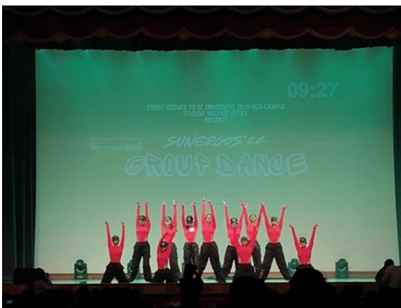
Karma students performing at Gargi college