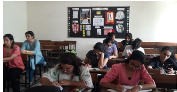
Participants composing poems at the Poetry Writing Competition organized by Of Muses and Bards on 26.5.2023