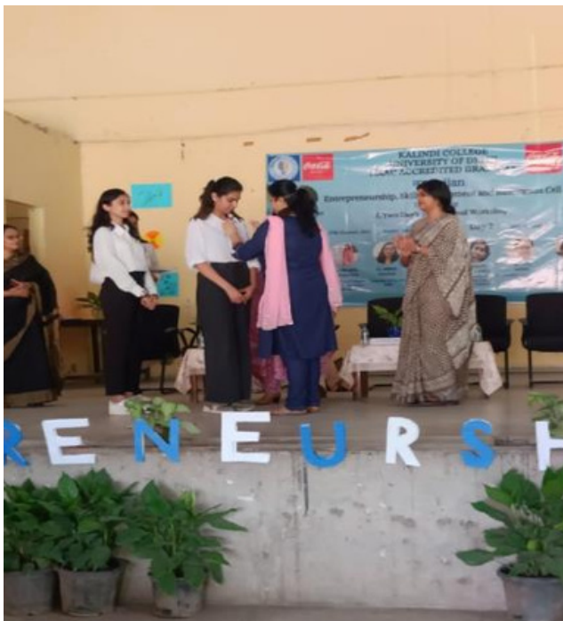
Badge ceremony held on 27th October 2023