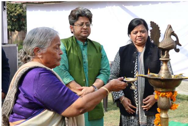
Lamp lighting ceremony