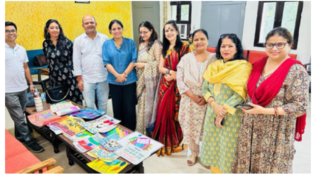
स्त्री सशक्तिकरण पोस्टर प्रतियोगिता के निर्णायक मण्डल