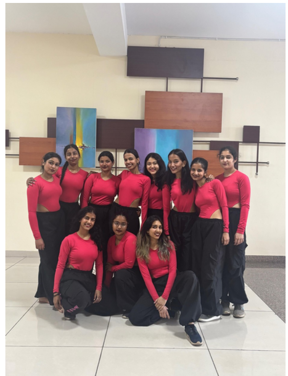
Team karma performing at Christ