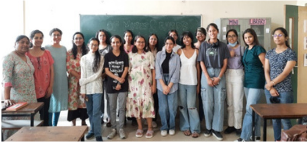
Teachers and participants at the Poetry Writing Competition organized by Of Muses and Bards on 26.5.2023.