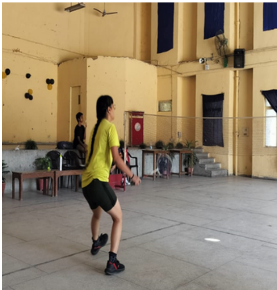
Inter Class Matches- Badminton