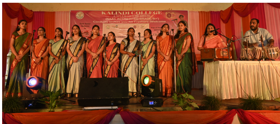
Swagat Geet by Music Department