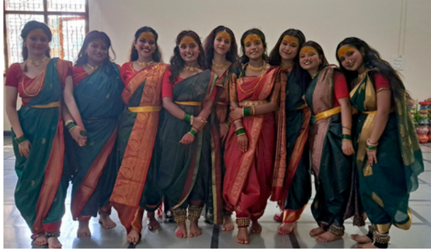
Team Nupur performing at IIT Kanpur