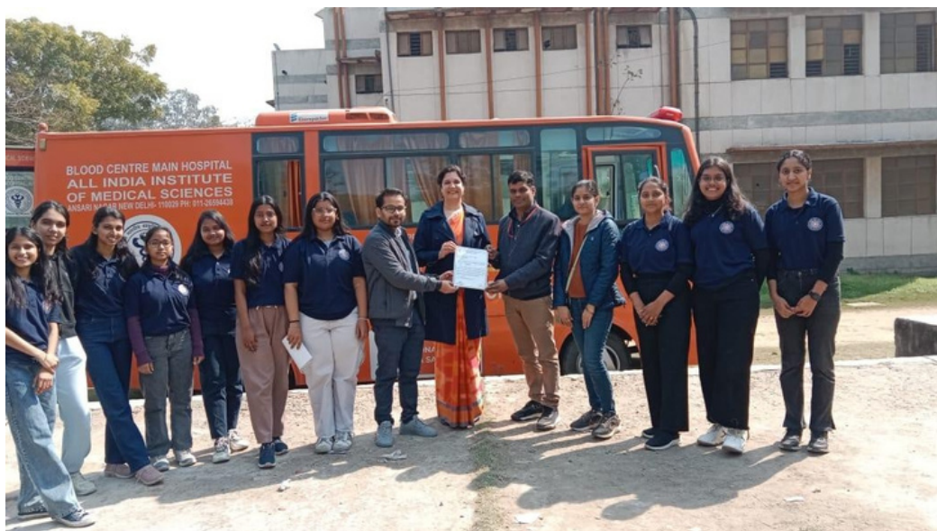
BLOOD DONATION DRIVE, JANUARY 15, 2024