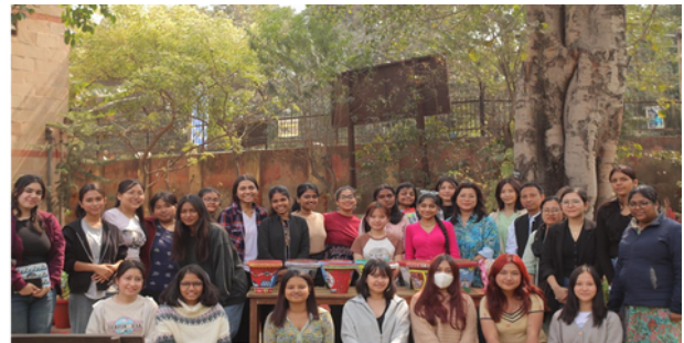
NE Students' Cell & Gardening Committee Faculty members with OBs and artist after the Pot Painting Competition under the theme Vikshit Bharat on 1st March, 2024