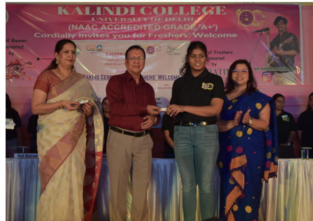
Giving away of badges to student union