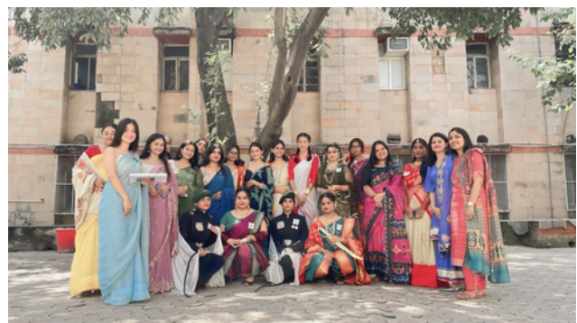
Faculty members, volunteers along with the participants during the event Veerangana on 20th September, 23