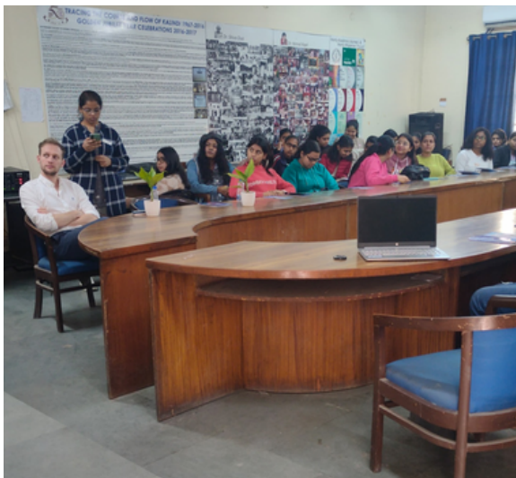
Seminar on overseas study