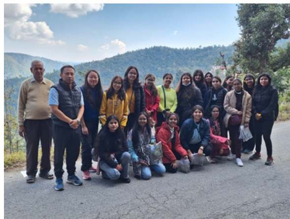
Botanical Trip to Mukteshwar 28th October 2023 to 1st November 2023