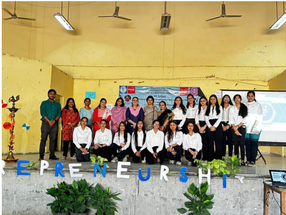
ESDI cell (NavSrijan)team