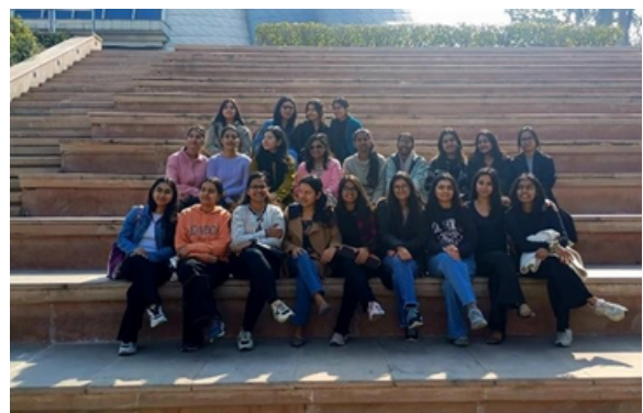
Economics Hons 3rd Year students & teachers on an educational trip to Pradhan Mantri Sangrahalaya