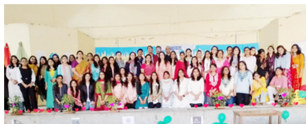
Glimpses of Rasayanika'24