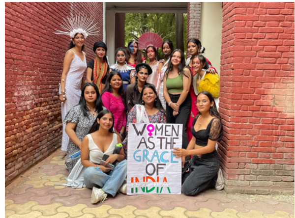
Team Fashionista at Maitreyi College for an inter college competition on 6th November, 2023