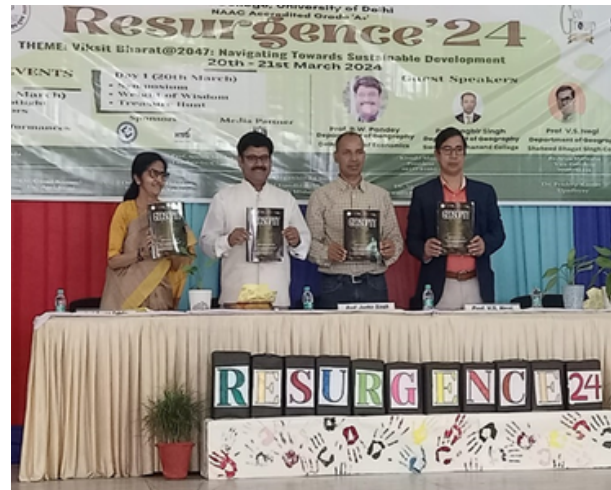
Releasing Geoshopy Volume VII Magazine of Geography Department