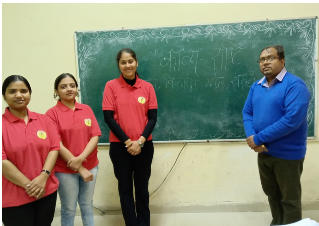
Kavya stuti Held on 28th February 2024