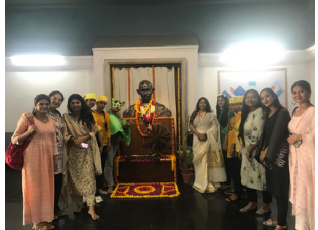
गाँधी संग्रहालय में 2 अक्टूबर 2023 को नाट्य प्रस्तुति मेरी मातृभाषा मेरा अभिमान में छात्राएं