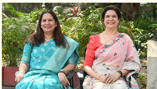
National Service Scheme (NSS)