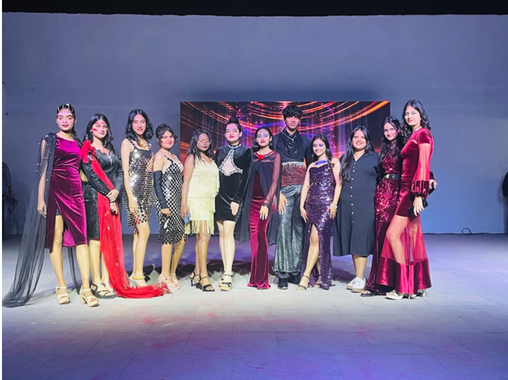
Team Fashionista in IIT Delhi under their annual fest Parivartan secured the second runners up position.