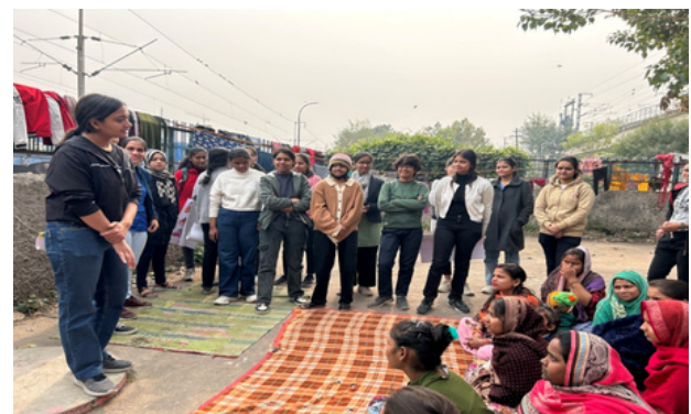
Visit To Slums Shiv Basti, Interaction With The Ladies