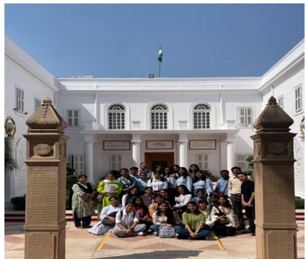
Gandhi Smriti Visit, Delhi