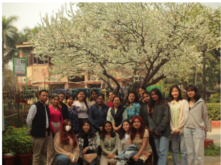
North East and Gardening Committee members with painters on 1st March 2024