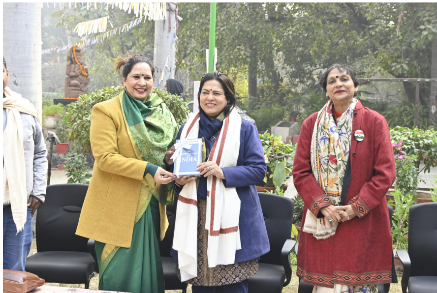
Principal felicitating the Guest, Mrs. Meenakshi Lekhi, Minister of State for External Affairs and Culture of India