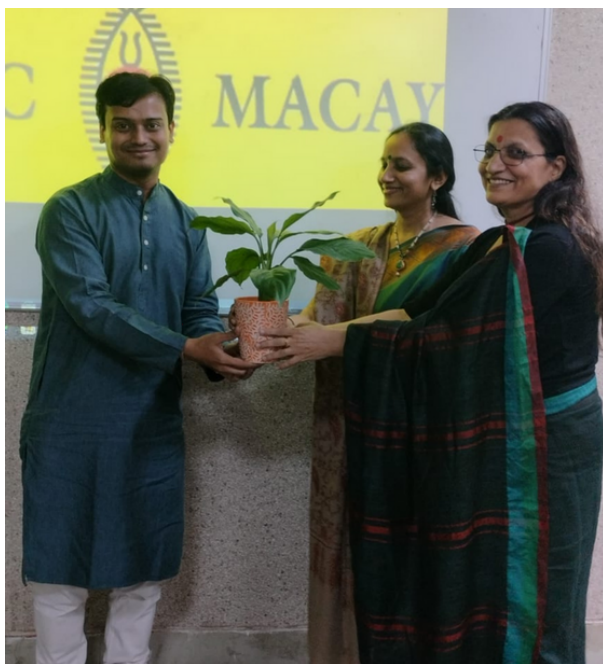
SPICMACAY ORIENTATION 2024