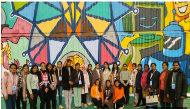
Volunteers During India International Science Festival