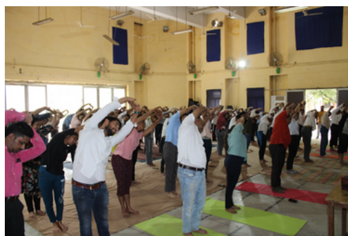
Staff and Students attended the session