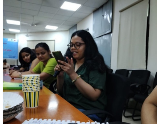
Picture from the Poetry Writing Workshop on the theme Meri Maati, Mera Desh on 22.9.23