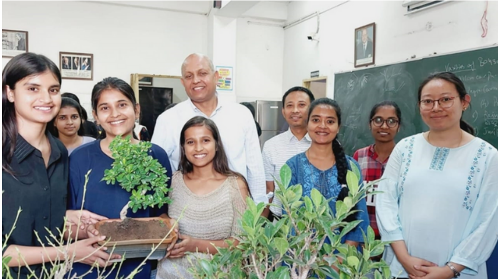
Faculty and students with bonsai plants during the hands-on workshop