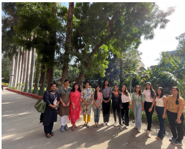
Faculty members with the participants