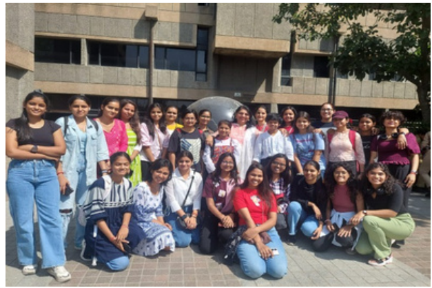
Visit To National Science Centre