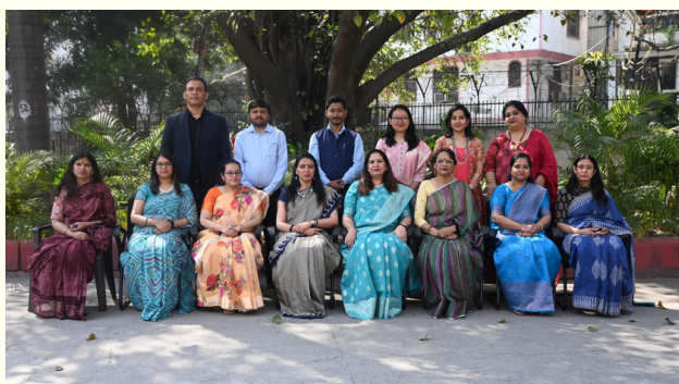
Annual Report Committee