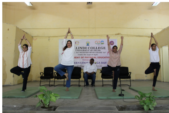
Principal performing asanas with staff and students