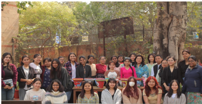
NE Students' Cell and Gardening Committee Faculty members with OBs and artist after the Pot Painting Competition under the theme Viksit Bharat on 1st March, 2024