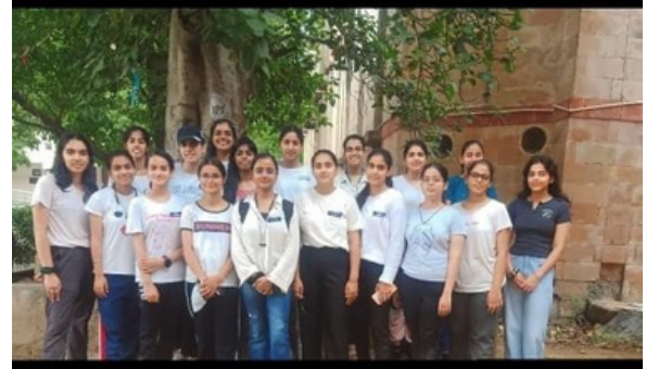
International Yoga Day June 26, 2023