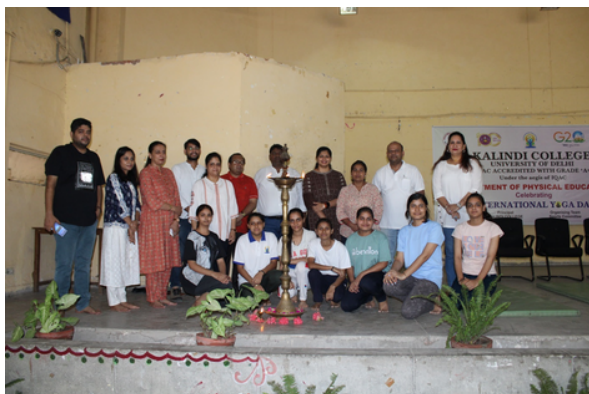
Lamp Lightening ceremony