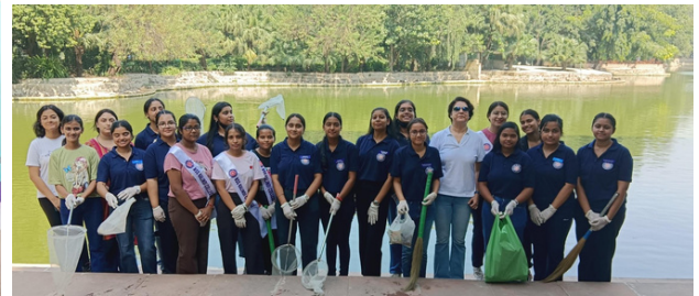
Swachata Pakhwada, October 1, 2023