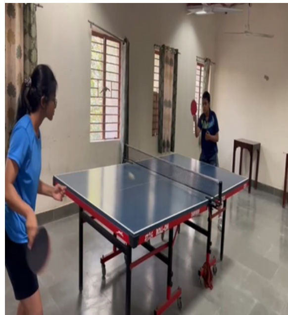
Inter Class Matches- Table Tennis