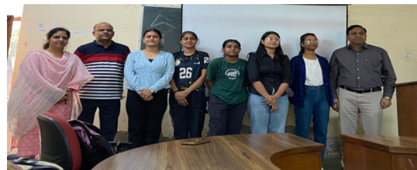
Winners of the competition