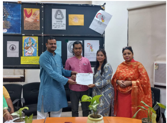
Ten Days Sanskrit Speaking Shivar w.e.f. 10th April,2023 – 21st April,2023