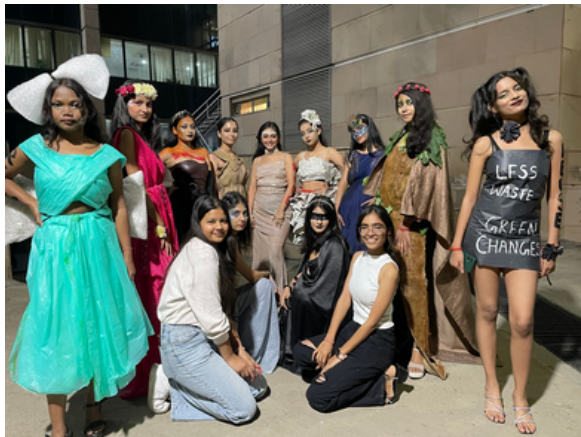
Team Fashionista at Teri school of advanced studies for an inter college competition on 7th December, 2023