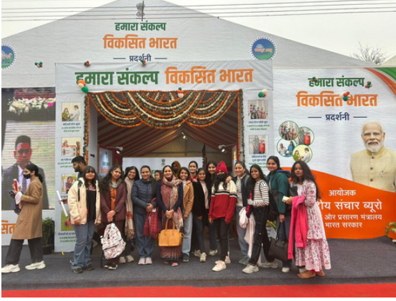
Educational Field Trip Under Viksit Bharat