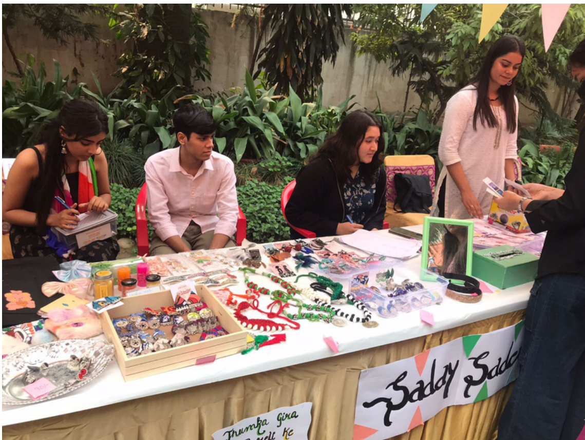
Stalls during Diwali Mela