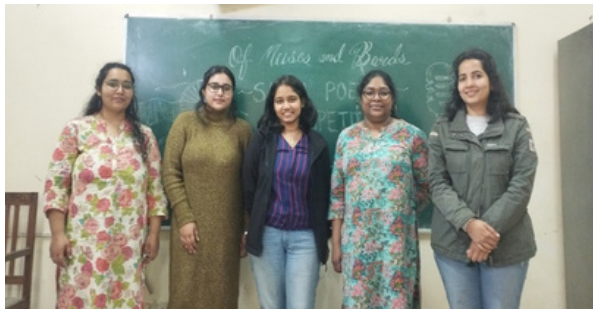
Participants and teachers during Viksit Bharat: slam Poetry Competition 28.2.24