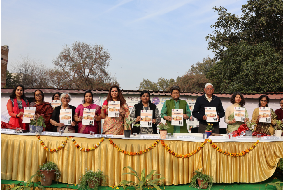
Launch of Alumni Newsletter