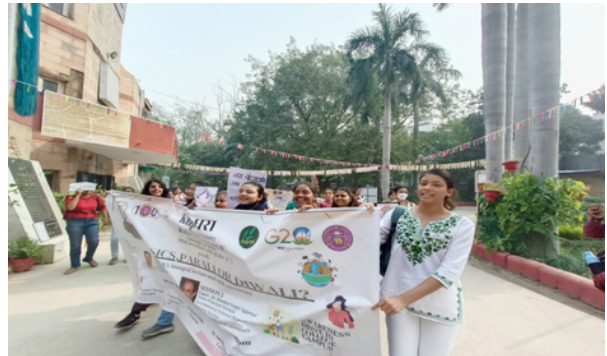
Awareness drive on Air Pollution