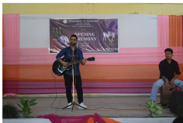
Musical Fusion: The Fusion Band Electrifies the Audience with a Harmonious Blend of Genres