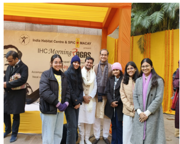
Kalindi student volunteers in SPIC MACAY