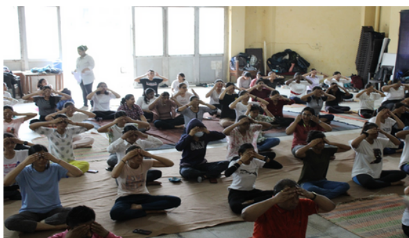
Students doing Pranayam