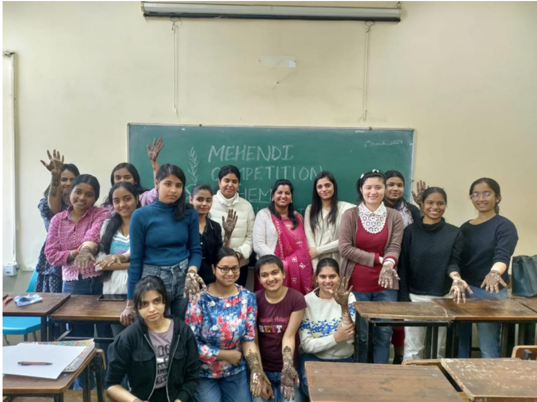
Glimpses of Mehendi Competition