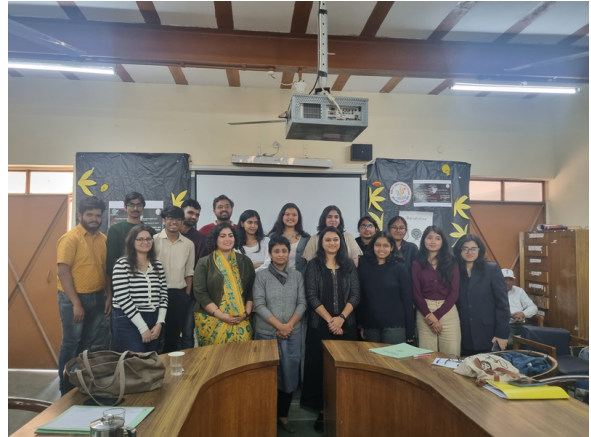
Student Seminar titled “From Page to Panel: Navigating Narratives through Graphic Novel” organised by the English Literary Society on 6th March 2024