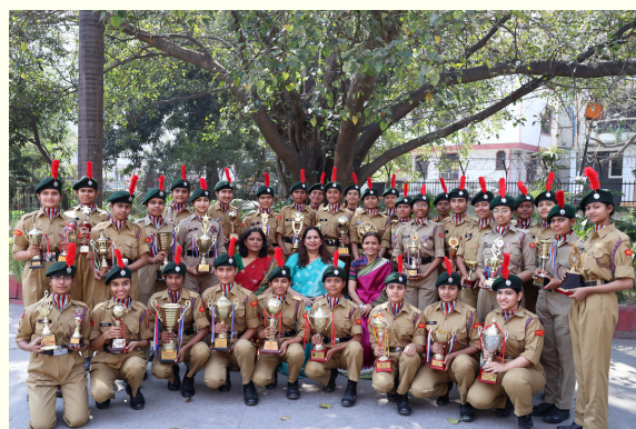
National Cadet Corps (NCC)