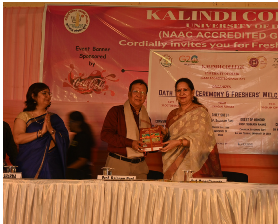
Principal felicitating the Chief Guest