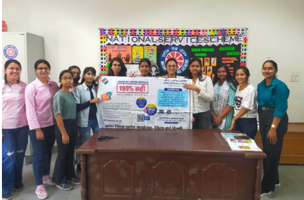
VOTER'S DAY, JUNE 27, 2023