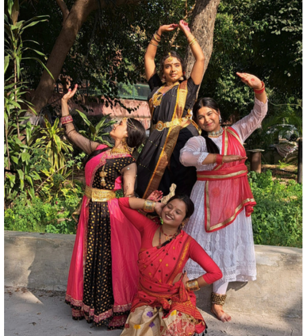
Team Nupur performing at Motilal Nehru College