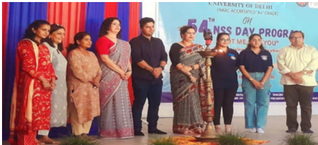
54th NATIONAL SERVICE SCHEME (NSS) DAY CELEBRATION, SEPTEMBER 26, 2023