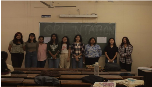
North East Students' OBs 2023-24 during Orientation cum Oath taking on 19th Nov, 23