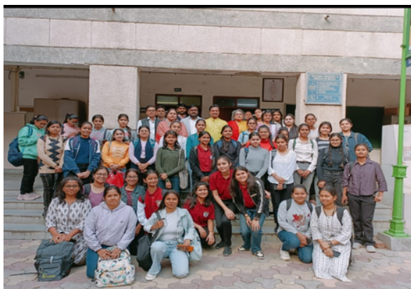
Seminar On Indian Knowledge System