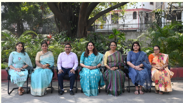
Internal Quality Assurance Cell (IQAC)