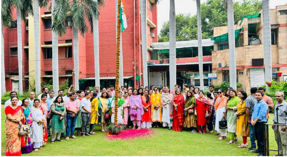
Independence Day Celebration 2023