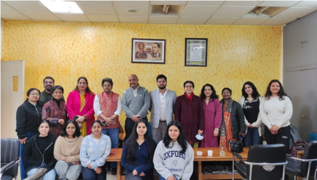
Networking and Career Planning Workshop organised by the English Literary Society on 14th February 2024 under the aegis of Viksit Bharat Abhiyan