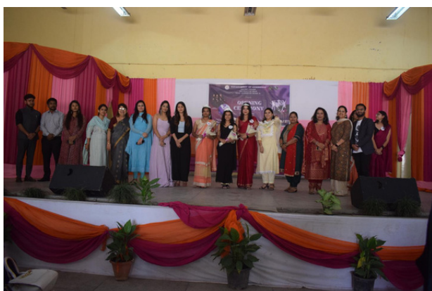
Unveiling Excellence: Celebrating Achievement at the Ms Commerce Fresher's Prize Announcement