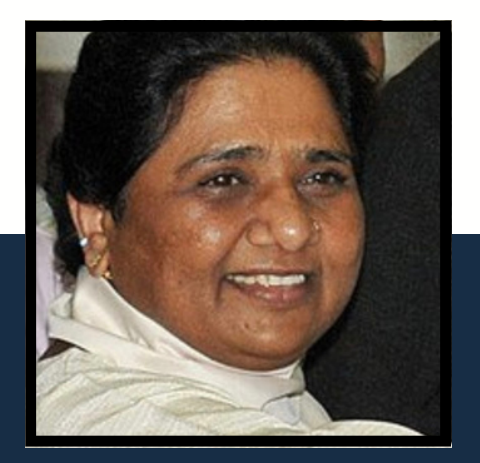
Mayawati Politician (former Chief Minister, Uttar Pradesh) Batch:1975