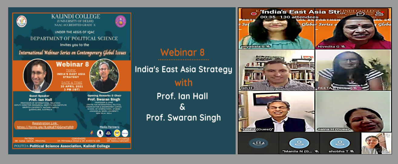
WEBINAR 8: INDIA'S EAST ASIA STRATEGY

WEBINAR 7: LEVERAGING SOFT POWER TO REALIZE NATIONAL INTEREST REFLECTIONS ON INDIA'S FOREIGN POLICY SINCE INDEPENDENCE