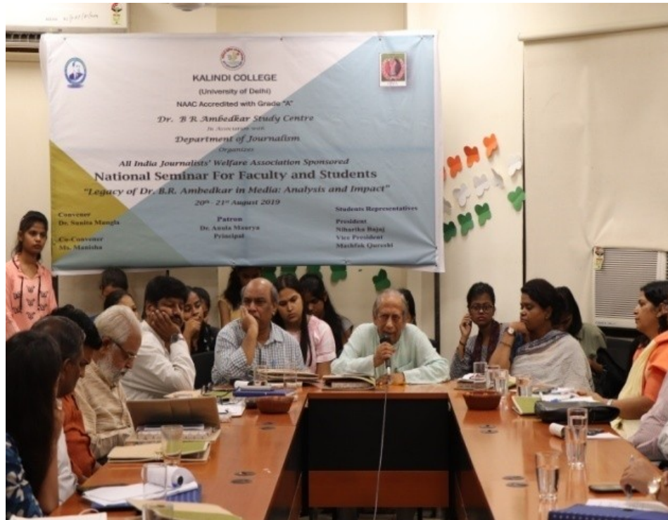
Distinguished Guests at the Inaugural Session