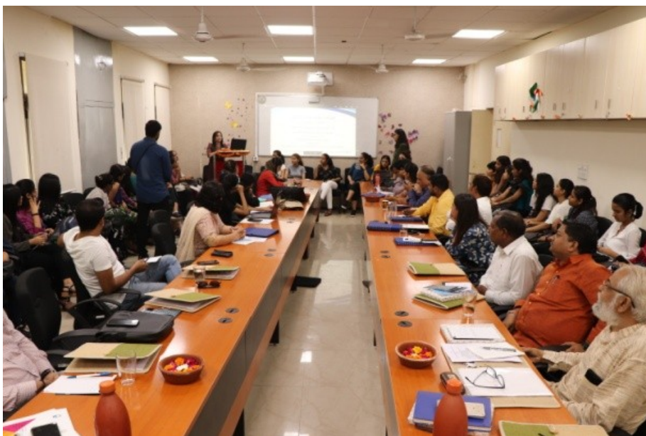
Scholars presenting their papers during the seminar