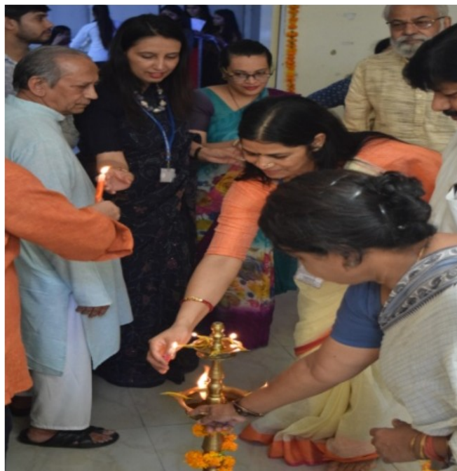
Lamp Lighting ceremony during the inaugural session