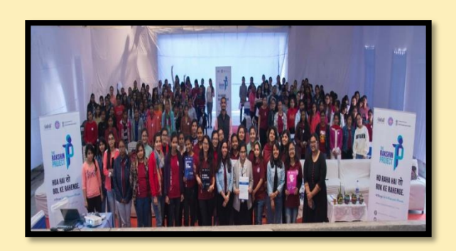
Workshop on POCSO Act and legal rights as a part of Rakshin Project of Sakshi NGO