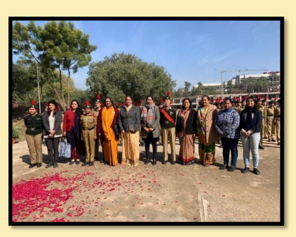
Teachers and NCC cadets participating in flag Hoisting on Republic Day.