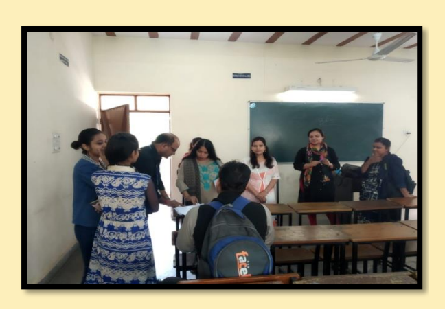
Teachers interacting with parents during PTSI