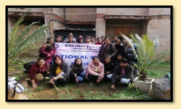
Tree Plantation Drive by NSS