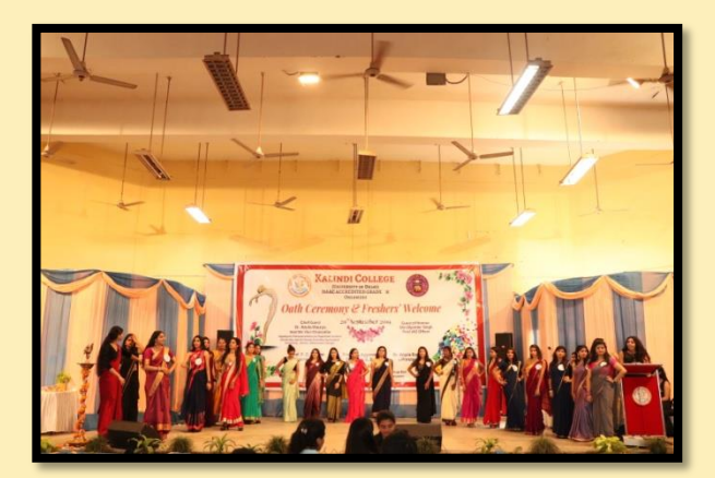
Participants during the event Miss Kalindi-2019