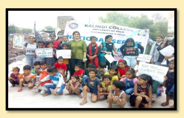
Students working in a Slum during Swachhta Abhiyan Pakhwara organised by NSS