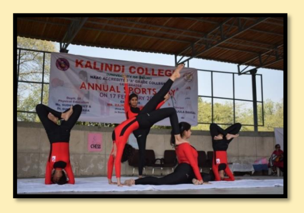
A Performance of Yoga Postures by Students on Sports Day