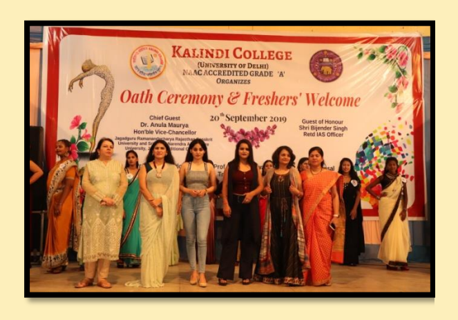
Judges of Miss Kalindi-2019 alongwith students, on Stage during Oath Ceremony and Fresher's Welcome.