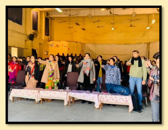
Faculties and Students taking Pledge on the Republic Day