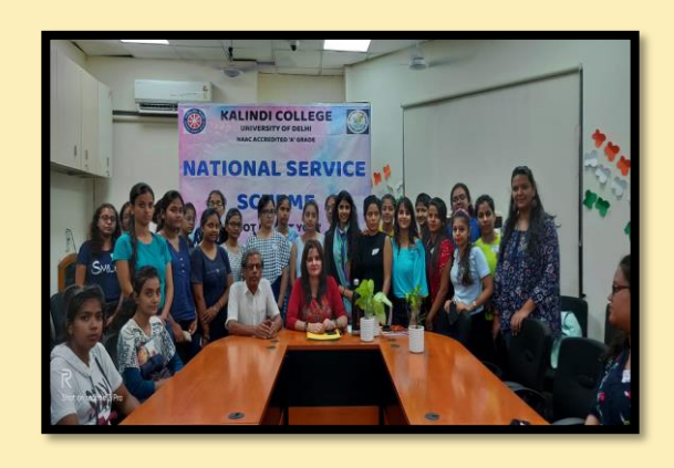
Talk on Water Conservation by NSS unit of College