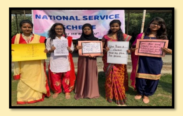
NSS organised an event for Promoting Communal Harmony.